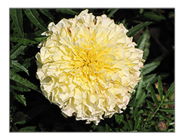
Vanilla Marigold flowers