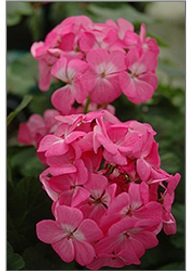
Pillar Pink Geranium flowers