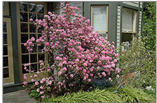
Olga Mezitt Rhododendron in bloom