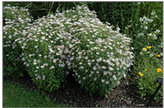
Blue Star Japanese Aster in bloom