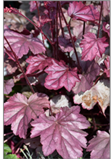
Stainless Steel Coral Bells foliage