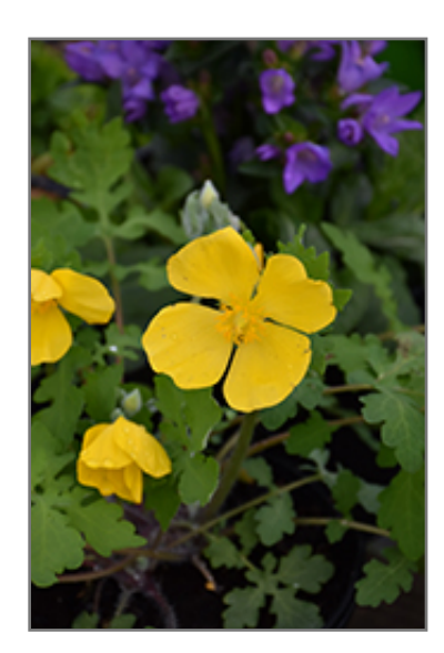
Celandine Poppy flowers