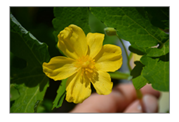
Celandine Poppy flowers