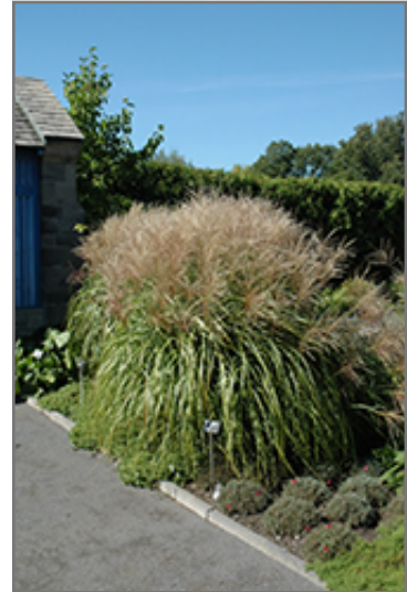
Huron Sunrise Maiden Grass

Huron Sunrise Maiden Grass is recommended for the following landscape applications;