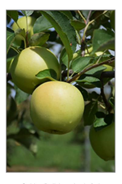
Golden Delicious Apple fruit

Golden Delicious Apple features showy clusters of lightly-scented white flowers with shell pink overtones along the branches in mid spring, which emerge from distinctive pink flower buds. It has forest green deciduous foliage. The pointy leaves turn yellow in fall. The fruits are showy chartreuse apples with yellow overtones, which are carried in abundance in mid fall. The fruit can be messy if allowed to drop on the lawn or walkways, and may require occasional clean-up.